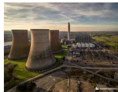
Rugeley Power Station