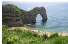
Durdle Door (Jurassic coast)