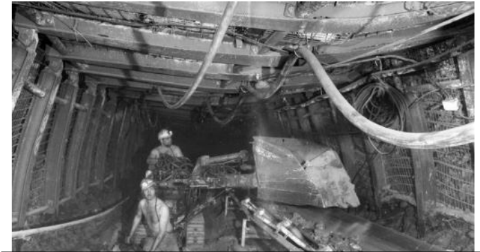
Lea Hall Colliery, a huge mine, was opened in Rugeley in 1960. It closed in 1991.