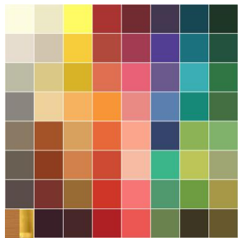
dark colours and light colours