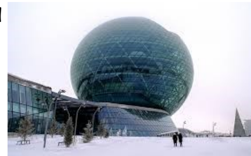
Nur-Alem Sphere, Kazakhstan