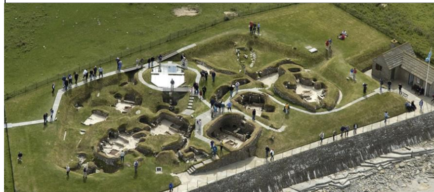
Skara Brae - Stone Age settlement.

The Stone Age, Bronze Age and Iron Age in Britain are usually known as the period of prehistory, meaning before written records of history began. It begins with the earliest hunter-gatherers coming to Britain from Europe around 450,000BC and ends with the invasion of the Romans in AD43.