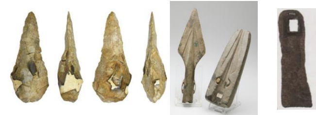
Tools from the Stone, Iron and Bronze age.