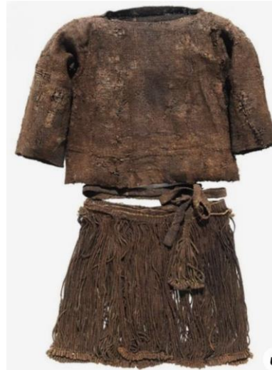
Clothes from the Stone Age.