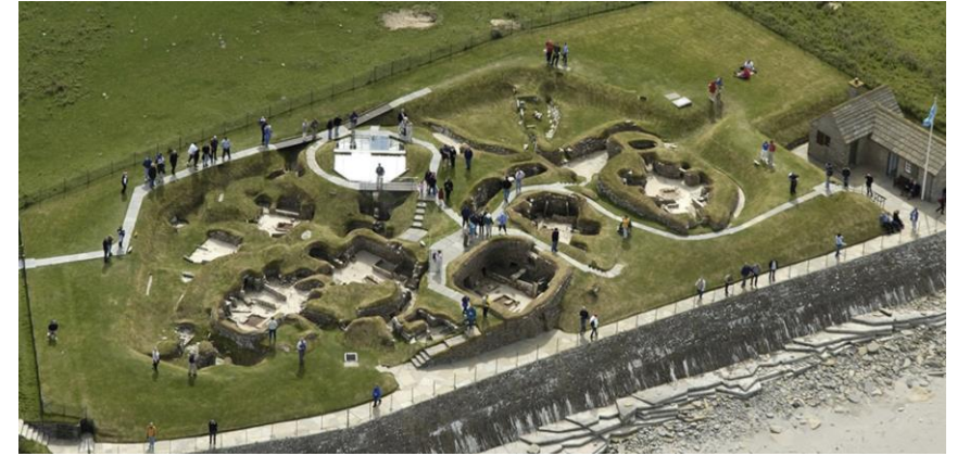
Skara Brae - Stone Age settlement.