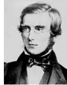
Joseph Dalton Hooker (1817-1911)

Joseph Hooker was a doctor and travelled to many places. He was a plant collector and botanist and brought many plants back to the UK. Joseph was interested in finding out why plants grow in the locations they do.